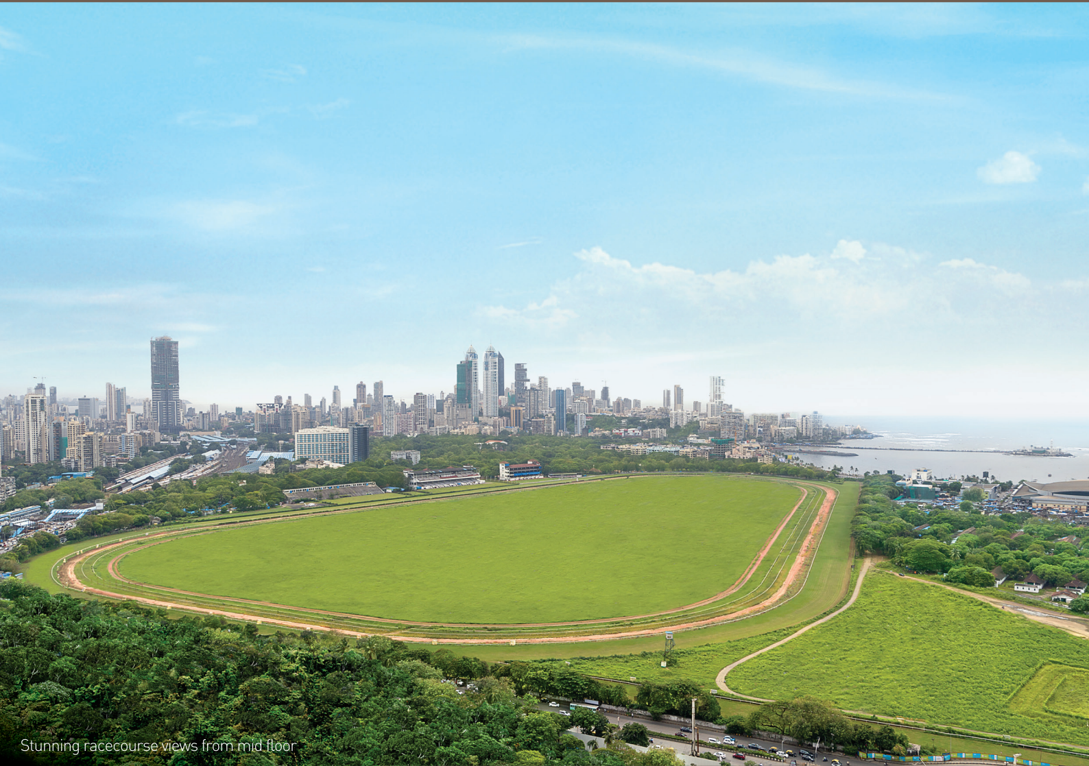
Stunning racecourse views from mid floor

Brought to you by India's No. 1 Developer