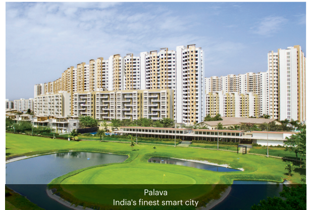
Palava India's finest smart city

Whether it's giving India some of its most iconic addresses, or crafting one of the world's most coveted residences in London, adding a glittering icon to Mumbai's skyline, or creating designer residences for Mumbai's glitterati, delivering meticulously designed offices for distinguished clientele or conceiving India's No. 1 smart city with the highest liveability quotient*, one name is transforming the way we live: Lodha.