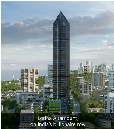
Lodha Altamount, on India's billionaire row