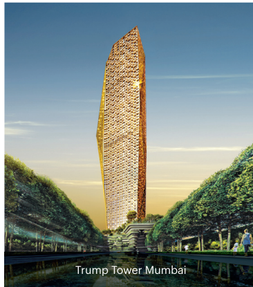
Trump Tower Mumbai